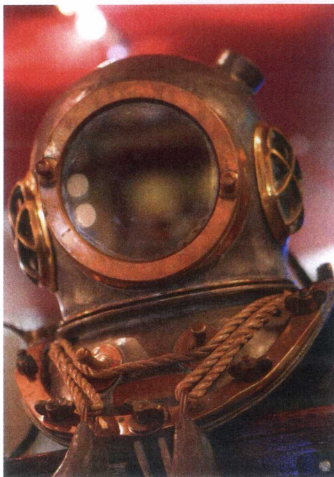
Vintage airplanes (top), at Santa Maria Museum of Flight. Antique diving helmet (above), at Santa Barbara Maritime Museum. Opposite page: Davy Crockett coonskin cap, at Shelbi Ranch Western Museum. 1936 Nimbus, at Solvang Vintage Motorcycle Museum.