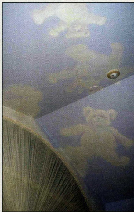
Looking overhead, visitors can see the ceiling covered with clouds that have transformed into fluffy white teddy bears.