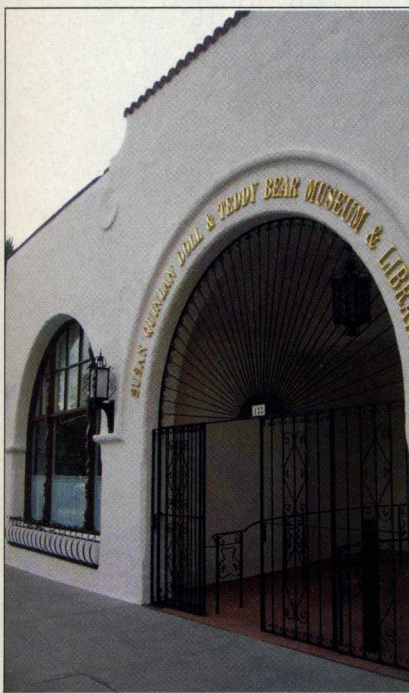
The restored building, just off the main shopping area of Santa Barbara, has huge arched windows with unique gathered curtains and custom teddy bear railings.

Visit the Susan Quinlan Doll and Teddy Bear Museum and Library, 122 W. Canon Perdido St., Santa Barbara CA.