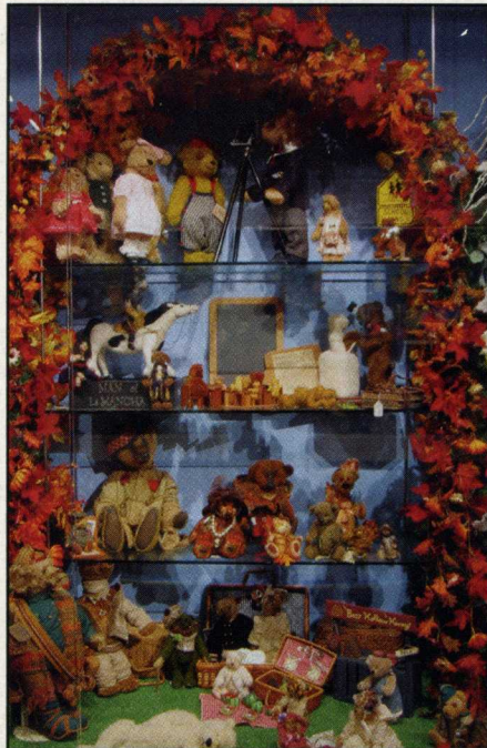
The museum's exhibits are arranged by theme, such as this "autumn" display.